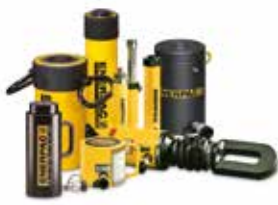
Cylinders & Lifting Products